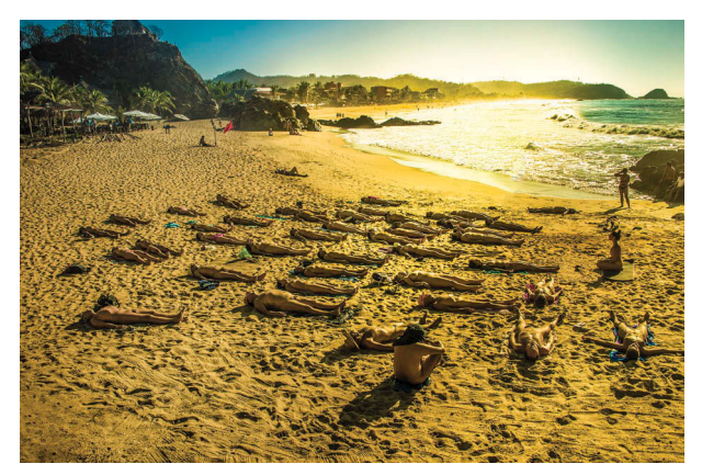
Figure 1. Zipolite Nudist Festival 2017

opportunity to show "textiles" what nudism is really about, including its benefits, and, consequently, to break associated stereotypes (see Figure 1). This was more of a collective than an individual motivation factor.